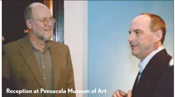
Reception at Pensacola Museum of Art

IHMC researchers collaborated with colleagues at Vecna to create