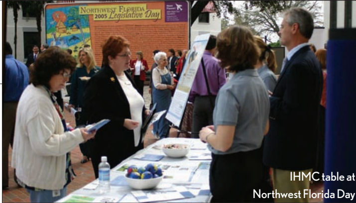
IHMC table at Northwest Florida Day