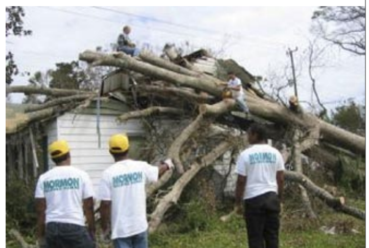
Volunteers coordinated by IHMC's Bradshaw