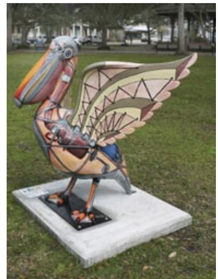
Come visit our RoboPelican on Adams Street near Seville Square

IHMC Institute for Human & Machine Cognition