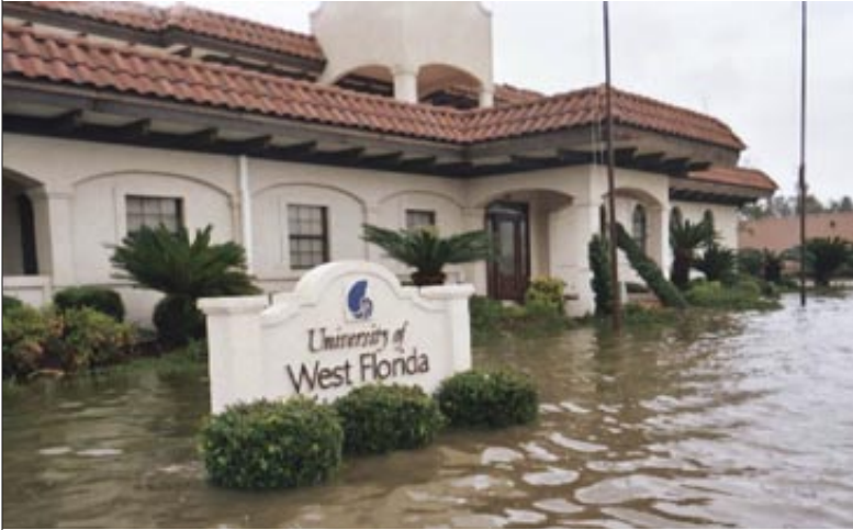
Flood waters take their toll at 40 S. Alcaniz Street