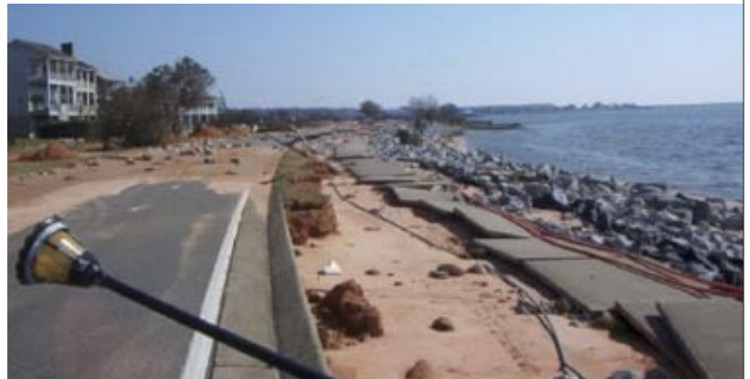
Bayfront Parkway takes a beating