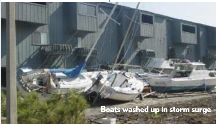
Boats washed up in storm surge

Even in the midst of taking care of their own situations, IHMC staff worked hard to