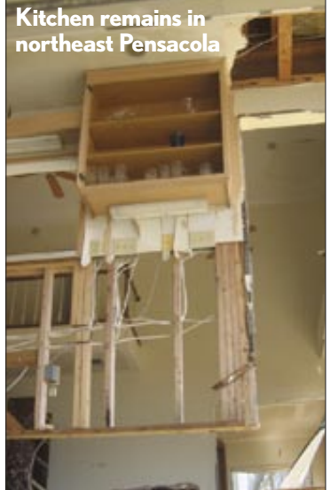
Kitchen remains in northeast Pensacola

help the rest of the community back on its feet. Jeff Bradshaw, who himself lost his home, helped coordinate the activities of volunteers for three weeks. The volunteers, members of the Church of Latter Day Saints from Pensacola and throughout the country, tallied nearly 70,000 hours of service, including repair or tree removal for over a thousand homes and feeding of thousands of others. Since many people were still living in shelters and repair crews have taken over many of the hotels, the volunteers simply camped out at churches. Other IHMC staff, too, helped in big and small ways to assist in recovery efforts.