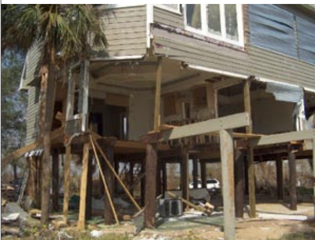
An all too common scene in Mackey Cove