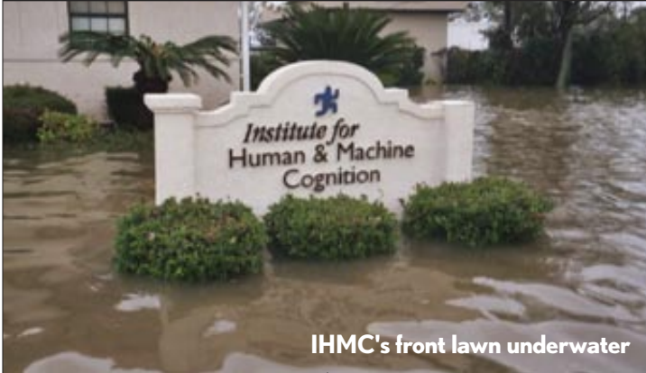
IHMC's front lawn underwater