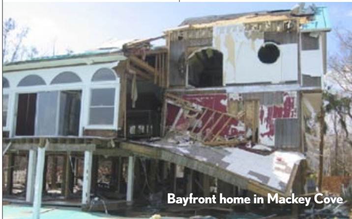
Bayfront home in Mackey Cove

While the IHMC buildings fared well, many of our researchers, like many other Pensacolians, saw major damage to their homes. Most suffered felled trees or leaky